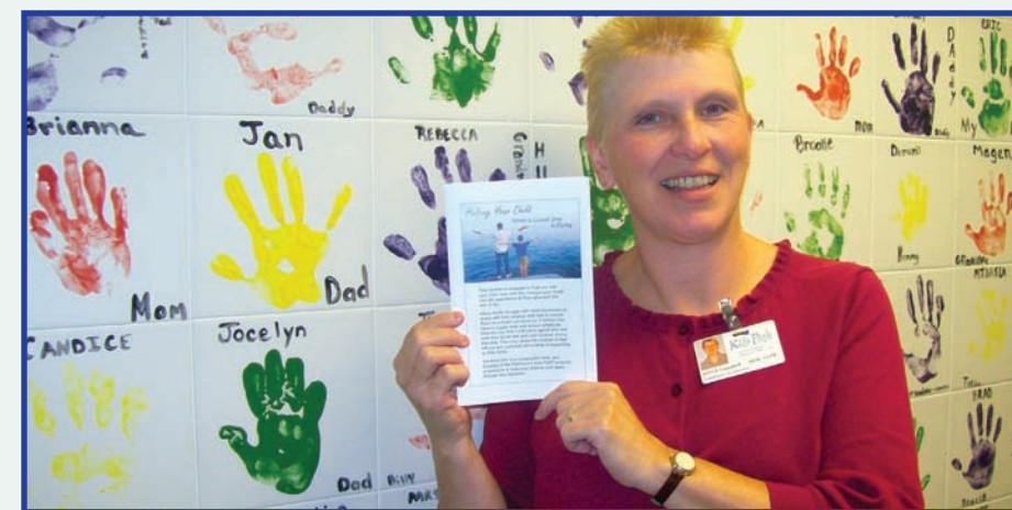
Kids Path booklet answers tough questions when a loved one is dying